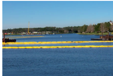
Light, Medium or Heavy Duty