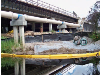
FL DOT Type I, II or III

Turbidity Curtain Floating Turbidity Barrier Silt Curtain Silt Barrier