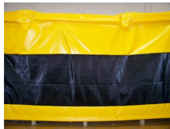
Permeable or Impermeable